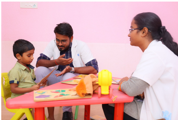
Speech Therapy Services

Speech therapists, Occupational Therapists, Special Educators and Clinical Psychologists involved in service delivery in the clinical arena. The diagnostic group comprises cerebral palsy (CP), Autistic spectrum disorders (ASD), Attention deficit hyperactivity disorders (ADHD), Learning disabilities (LD), Intellectual Disability (ID), Degenerative disorders such as Muscular dystrophies, Spinal Muscular Atrophy and other degenerative disorders. Parental nurturing for their children has been under practice through Pre-Linguistic behavioural training, Sensory-Motor activities, Adaptive physical education, Functional Independence connected with school readiness and facilitating Inclusion towards mainstream education in a regular school environment.