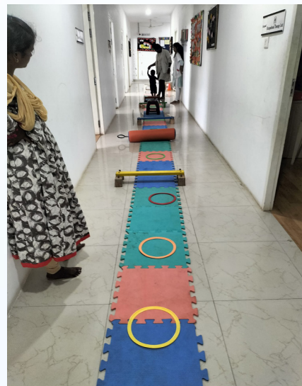
Special Education Services