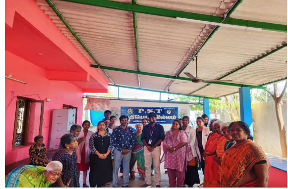
Awareness And Publicity Services