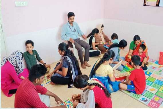
Intensive Parents Training Program