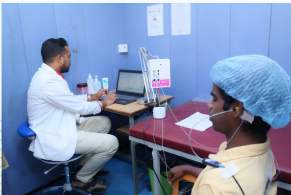
Electrophysiological Assessment - Neuro Audio and IHS Duet