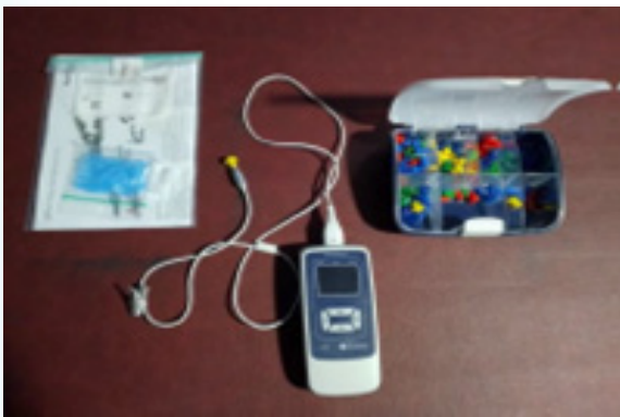
Oto Acoustic Emissions for New born hearing screening -MAICO ERO SCAN