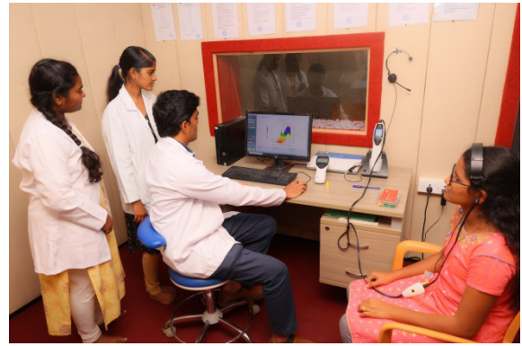
Advanced Middle ear analyser Interacoustics Titan