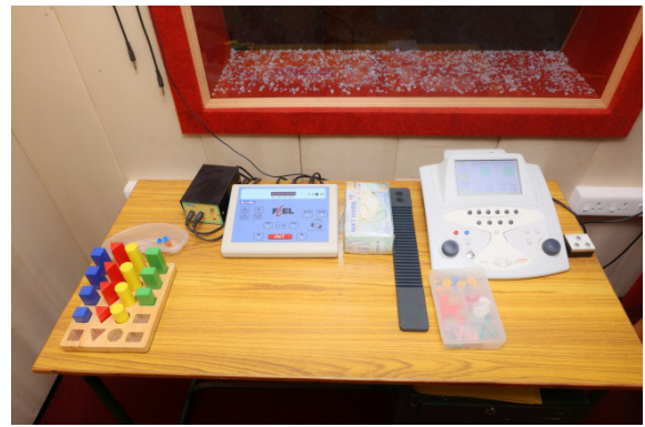
Global FEEL and Clarinet Inventis