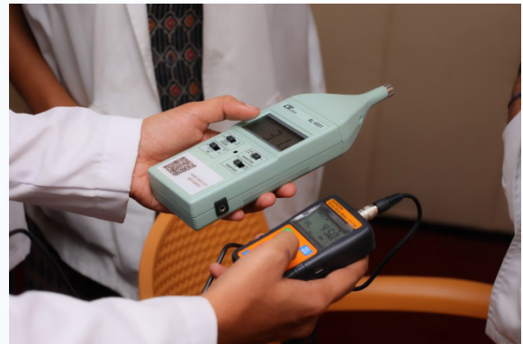
Noise measurement - Sound Level Meter and Noise Dosimeter