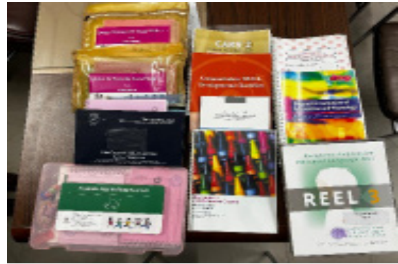
For children with communication and swallowing difficulties