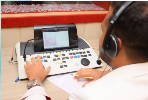
Advanced Audiometer Interacoustics AC40