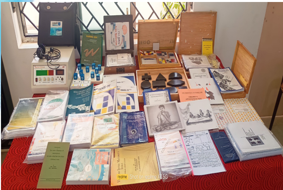
Psycho-Diagnostic Assessment And Test Materials