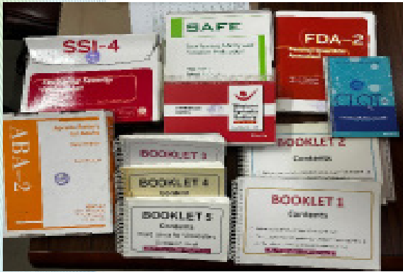
For adults with communication and swallowing difficulties