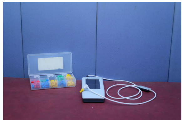
Oto Acoustic Emissions for New born hearing screening -Neuro Audio screen