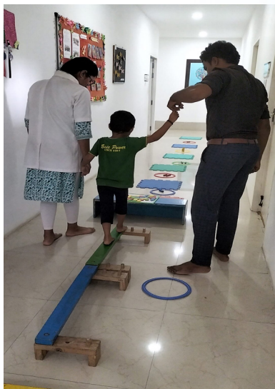
Early Intervention Services