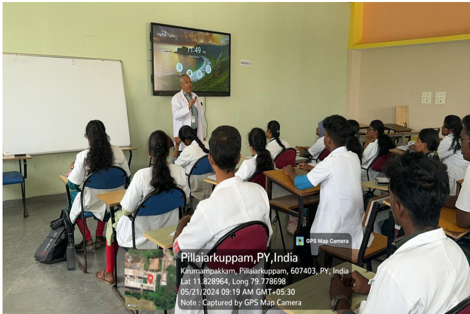
Smart Class Room