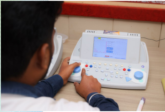
Pure Tone Audiometer Resonance R37A