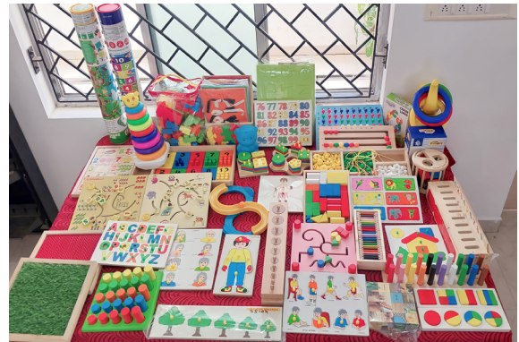
Psychological Training Materials